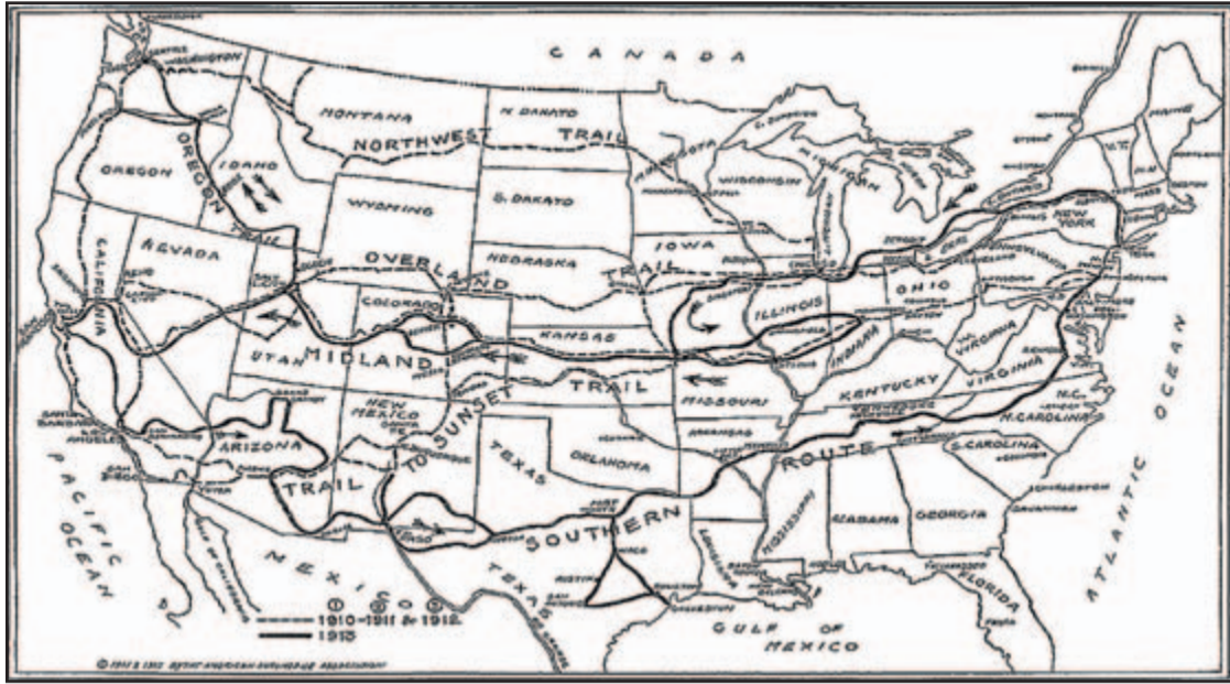
A 1913 map prepared by the American Automobile Association showing proposed coast-to-coast routes.